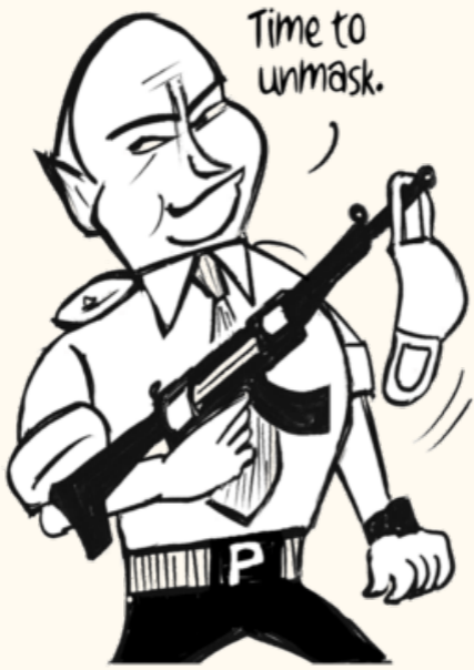
(24 Feb 2022)